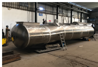
Remorque Equipements (Morocco)