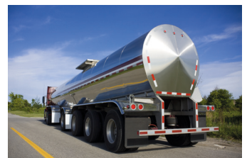
Remorque Equipements (Morocco)