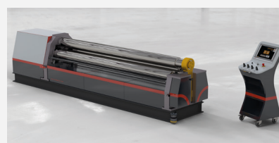
> R3h Easyroll version