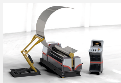
> Place tracker